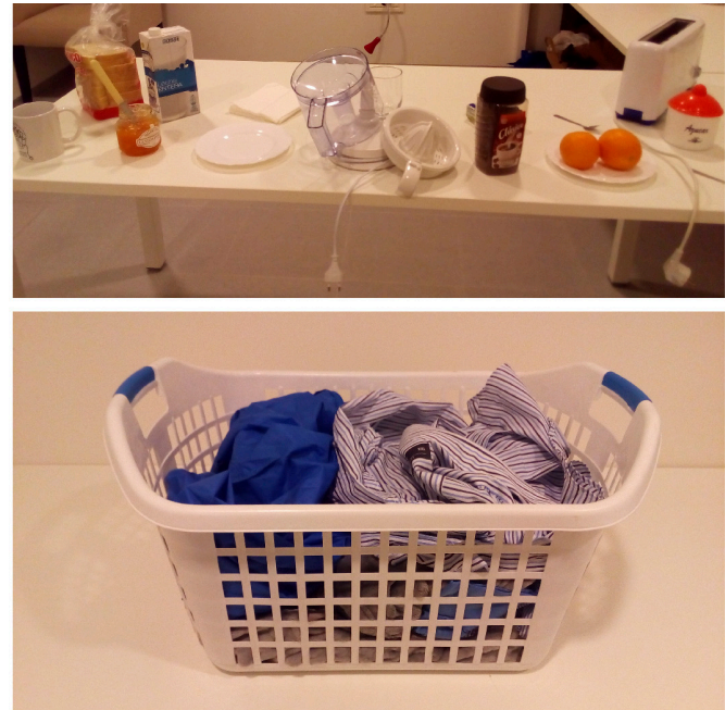
Figure 1 Possible presentation of the different objects in each of the awareness ADL: Orange juice with butter and jam and upper dress task. ADL, activities of daily living.

ADL, activities of daily living; BADL, basic ADL; IADL, instrumental ADL.